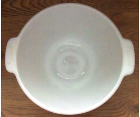
USAGE Bowl Mixing